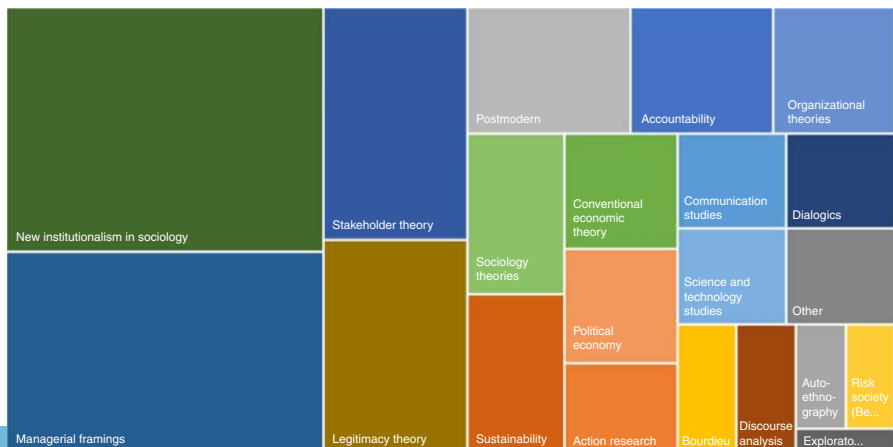
Figure 3. Theoretical approaches in engagement research

Institutional theory has been used to explain the findings of engagement research which in turn has been used to examine the explanatory power of various aspects of institutional theory.